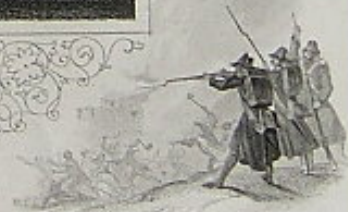
SLAUGHTER AT BURLINGTON 1800