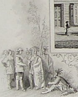
DIPLOMA TREATY WITH THE SIX NATIONS 1764