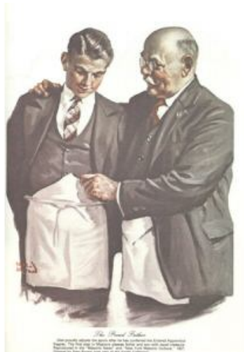
Like Father, Like Son ...